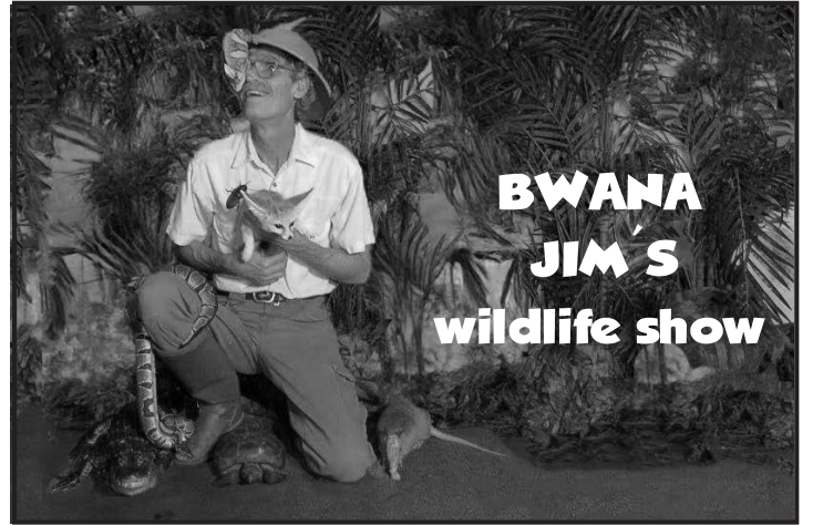
BWANA JIM'S wildlife show

Thursday..... 5:00 pm - 9:00 pm Friday..... 12:00 pm - 9:00 pm Saturday..... 10:00 am - 8:00 pm Sunday..... 10:00 am - 5:00 pm