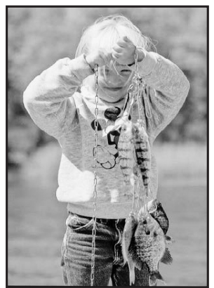
Scheels Kids Fishing Workshop Sat-Sun