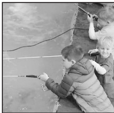
Live Trout Fishing (Every day)

Multispecies Fishing Success on Any Body of Water & Spinners for Walleyes